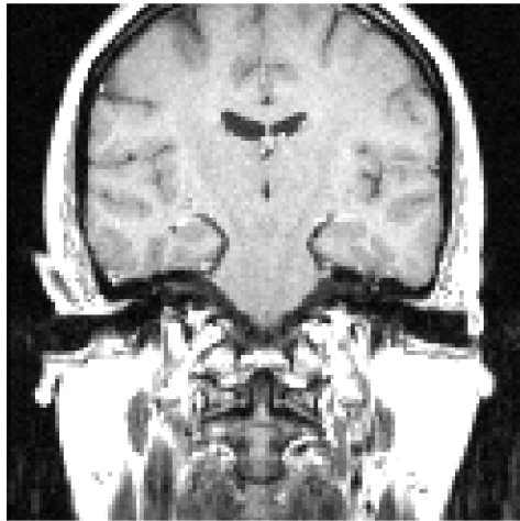
Series 16, Image 8